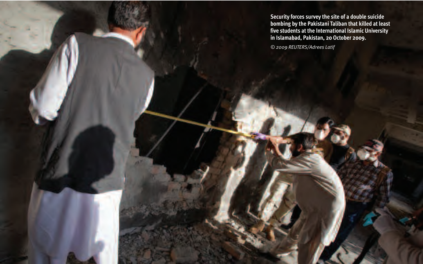
Security forces survey the site of a double suicide bombing by the Pakistani Taliban that killed at least five students at the International Islamic University in Islamabad, Pakistan, 20 October 2009.