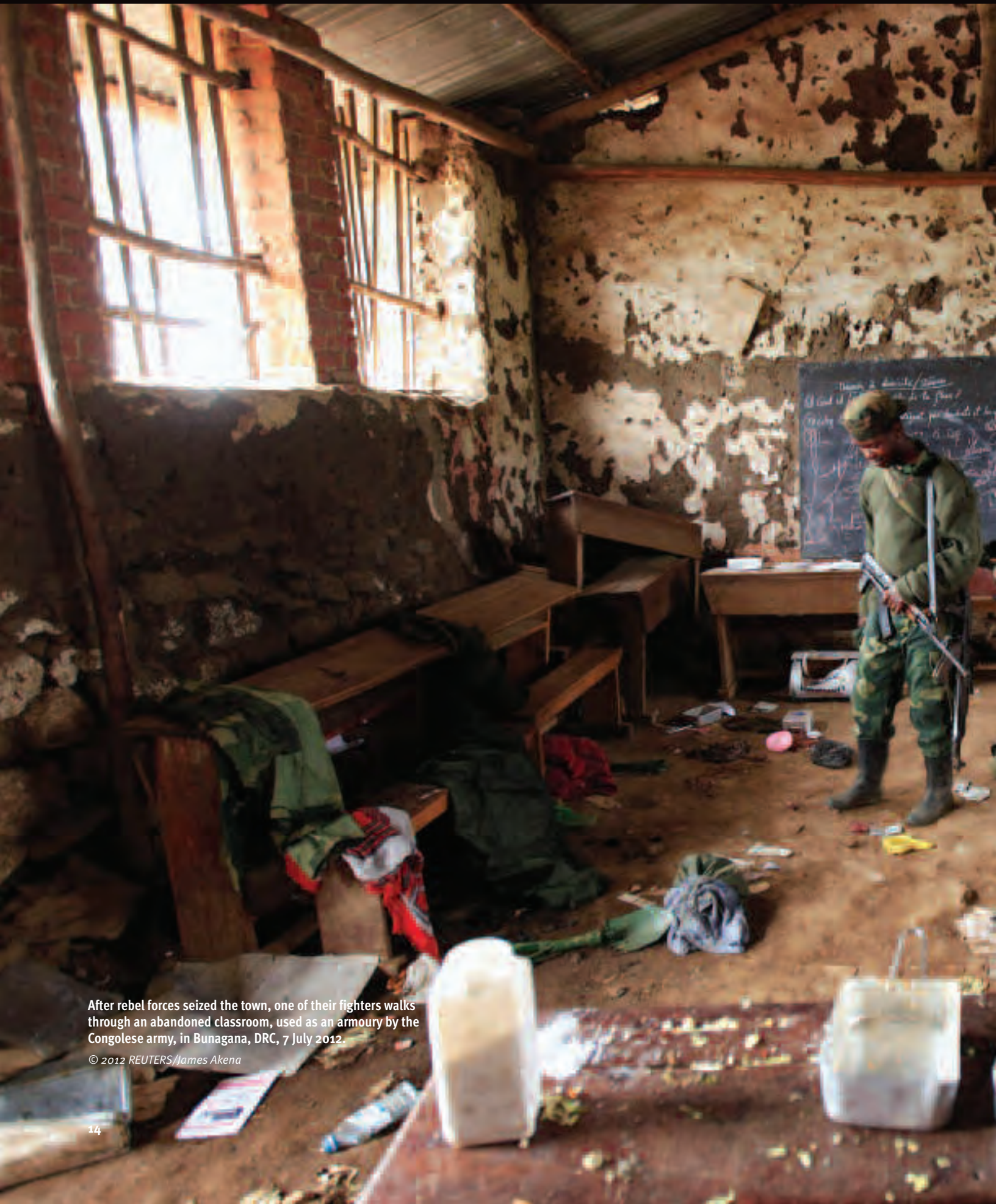
After rebel forces seized the town, one of their fighters walks through an abandoned classroom, used as an armoury by the Congolese army, in Bunagana, DRC, 7 July 2012.