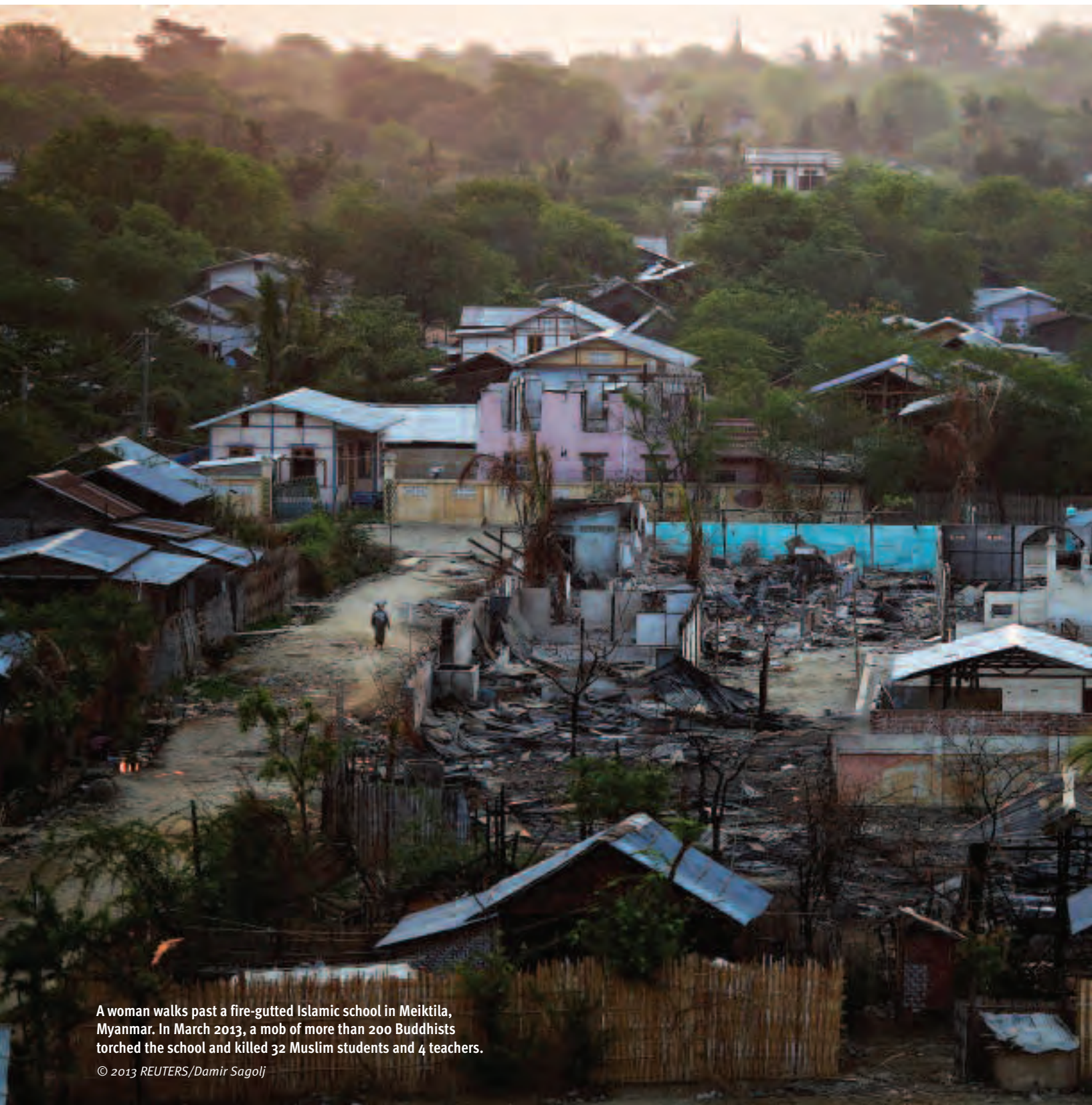
A woman walks past a fire-gutted Islamic school in Meiktila, Myanmar. In March 2013, a mob of more than 200 Buddhists torched the school and killed 32 Muslim students and 4 teachers.