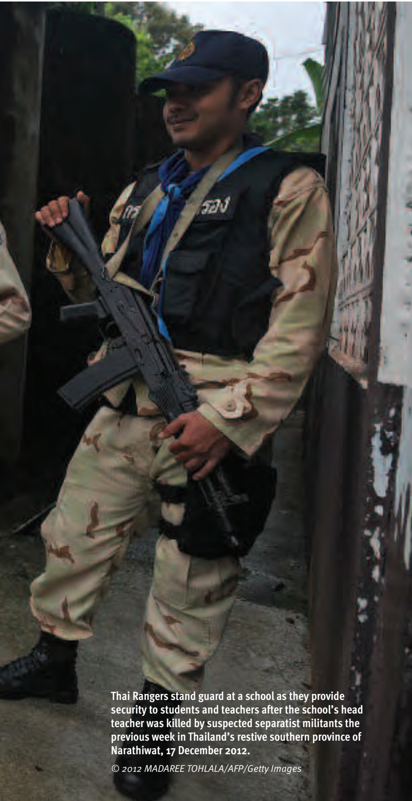
Thai Rangers stand guard at a school as they provide security to students and teachers after the school's head teacher was killed by suspected separatist militants the previous week in Thailand's restive southern province of Narathiwat, 17 December 2012.