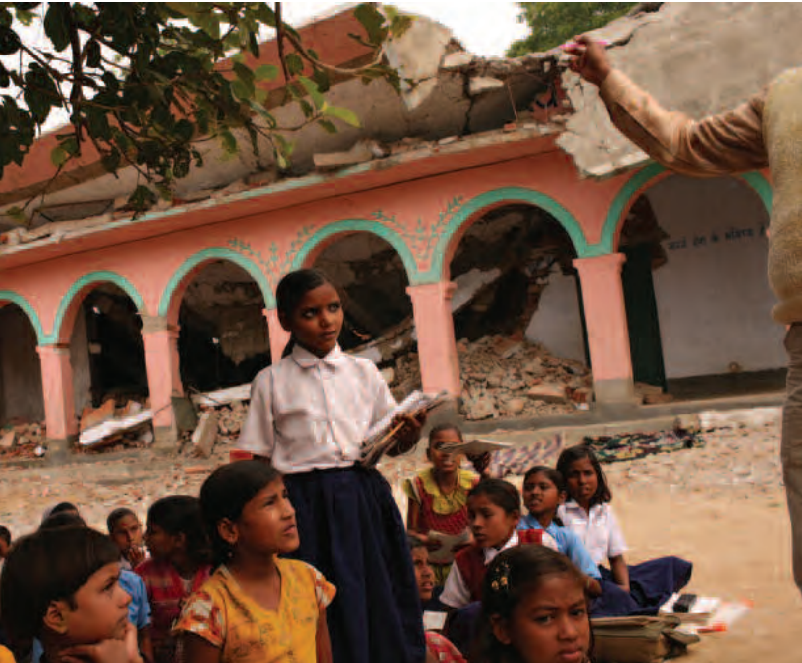
Schoolchildren sit in a makeshift classroom in the courtyard of the Birhni Middle School, Aurangabad district, Bihar state, India. The school was bombed by Maoist guerrillas on 27 December 2009.