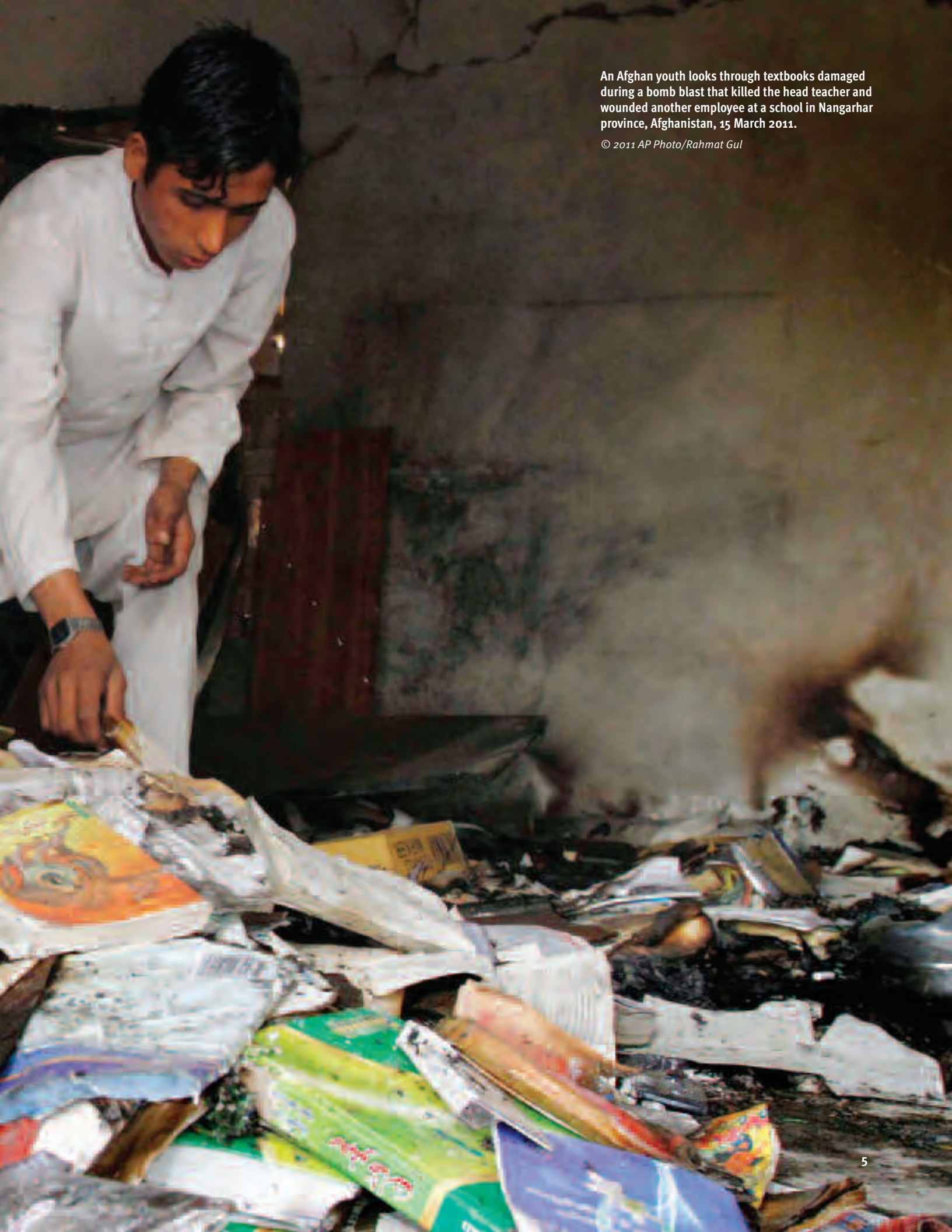
An Afghan youth looks through textbooks damaged during a bomb blast that killed the head teacher and wounded another employee at a school in Nangarhar province, Afghanistan, 15 March 2011.